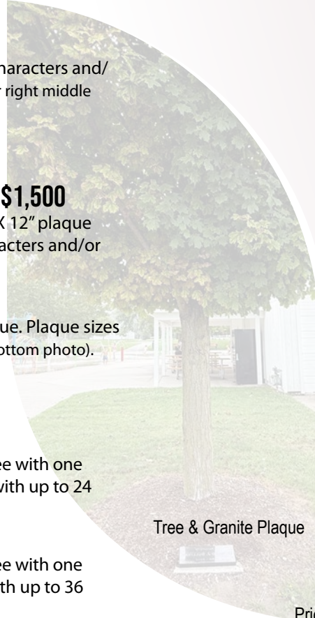
Tree & Granite Plaque

Includes your choice of one native shade tree with one 8" x 16" granite plaque including five lines with up to 36 characters and/or spaces (right photo).