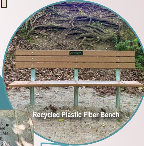
Recycled Plastic Fiber Bench